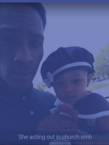
She acting out in church smh

"A Father hold his daughter's hand for a short while, but he holds her heart forever" - Author Unknown