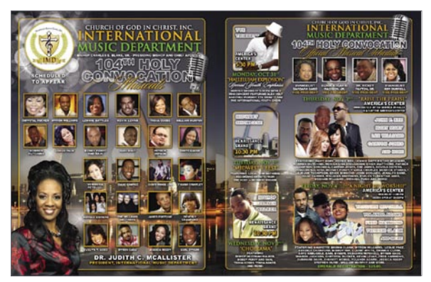
Two Full Page Ads, side by side