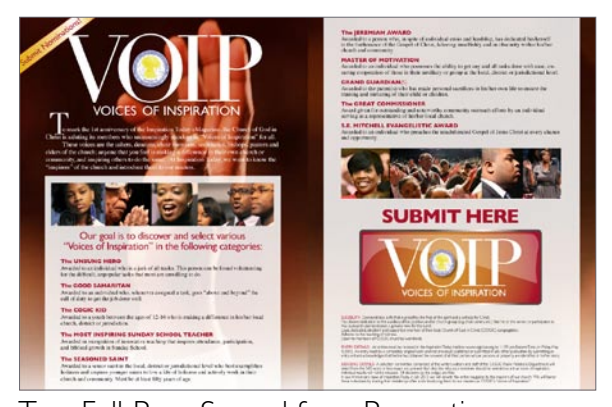
Two Full-Page Spread for a Promotion