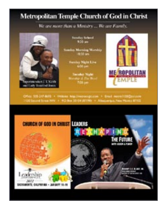
Two Half Page Ads